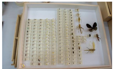
Collections of insects held in GDA.