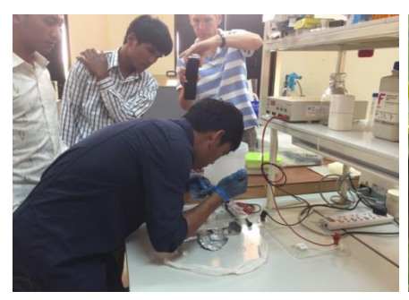
Loading PCR products for agarose gel electrophoresis.