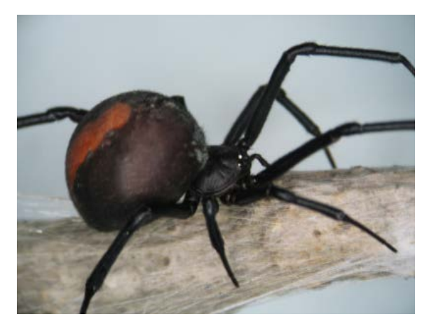
Figure 1. The redback spider, Latrodectus hasseltii (female)

The female spiders rarely bite unless they are touched or handled. Although no fatalities due to bites have been recorded since the introduction of anti-venom in 1956, bites are painful and must be treated as potentially dangerous. The male spider is much smaller and is not considered dangerous. Redbacks have a spherical abdomen, black legs and a black cephalothorax (where the legs are attached). The female usually has a red stripe on the top side (dorsal side) of the abdomen and an hourglass shaped red mark on the underside (ventral side) of the abdomen. The white or cream coloured egg sac is round with a smooth surface and is about 6 mm in diameter (Figure 1).