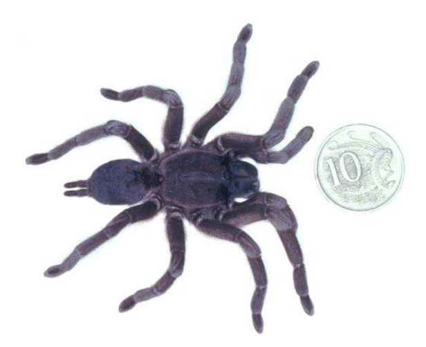
Figure 5. The barking spider, Selenocosmia sp.

Barking spiders are usually encountered in Palmerston and the rural area, and less frequently in Darwin suburbs. Specimens stored at Berrimah Farm indicate that these spiders were common in the residential areas of Darwin between 1964 and 1974. Some species of barking spiders include the largest spiders (in body size) known in Australia. They are brown to dark brown in colour with short hairs on the body giving them a furry appearance. Barking spiders live in burrows and emerge at night to catch prey such as insects, lizards, geckos, spiders or small birds. These spiders are generally not aggressive unless provoked. The venom is not considered dangerous although the bite can be painful (Figure 5).