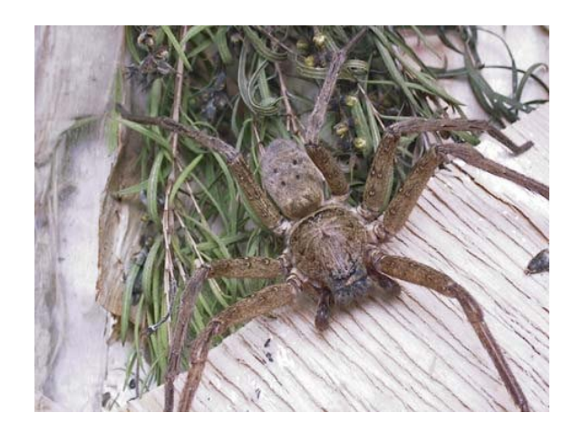
Figure 6. The huntsman spider, Heteropoda sp.

The most common huntsman spider species in the Darwin area is Heteropoda sp. which is mottled brown in colour. Other species occur and range from yellowish-brown, pinkish-brown to greyish-brown with markings on the underside of the abdomen and bright bands on the underside of the joints of the legs (Figure 6).