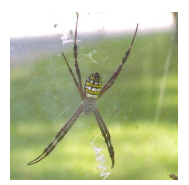
Figure 8. The St. Andrew's cross spider, Argiope sp. (female)

The St. Andrew's cross is a garden spider that is usually seen in a circular web with a cross pattern in the centre. The female spider is about 15 mm in body length. The carapace is silver grey and the abdomen has bands of yellow, red, white and black. The male is much smaller (about 5 mm) and is black and greyish. When the female spider is at rest in the middle of the cross in the web, it has its legs paired so that each pair rests on a strand of the cross. Flying insects such as flies, butterflies, damselfies, bees, and moths are trapped by the web. The spider rarely bites (Figure 8).