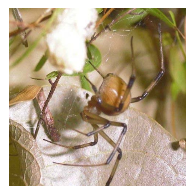
Figure 2. The brown widow spider, Latrodectus geomtricus (female)

The introduced brown widow spiders are related to the redback and are not considered dangerous. They are usually brown, grey or sometimes dark brown in colour with markings on the abdomen. Some specimens of brown widows and redbacks may look similar to untrained eyes. Examining the egg sacs can help distinguish between the two species. Although egg sacs of both species are white or cream in colour, those of the redback have a smooth surface and those of the brown widow have a rough surface (Figure 2).