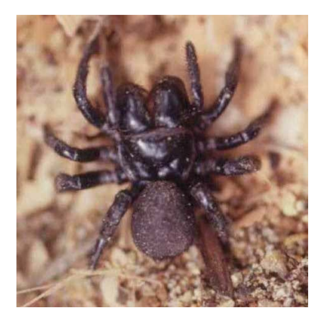
Figure 4. The northern mouse spider, Missulena pruinosa (female)