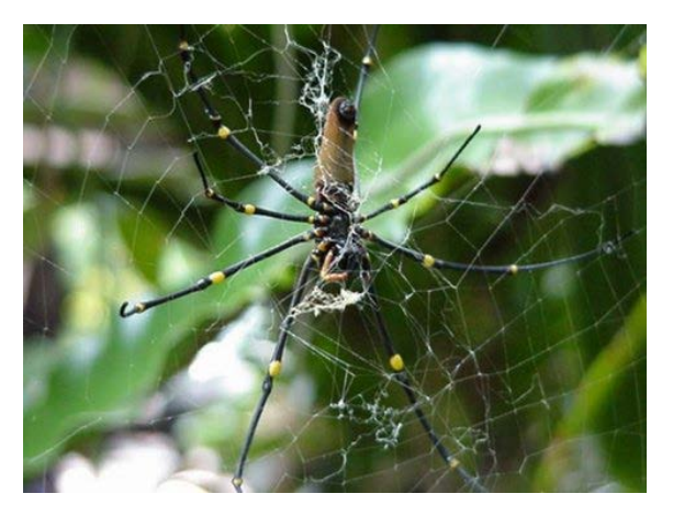
Figure 7. The golden orb web spider, Nephila insignis

The golden orb web spider builds enormous circular webs in gardens, orchards and rainforests (monsoon vine thickets). Webs are built by the female and are made of golden yellow silk which is quite strong and effective in catching flying insects. The female is up to 45 mm in body length. The cephalothorax (the united head and thorax) is black in colour while the abdomen is brown to olive brown. The female has black legs with yellow or orange bands at the joints. The male is much smaller, about 6 mm in length and is orange with large palps. Despite her size, the female is very gentle and rarely bites (Figure 7).