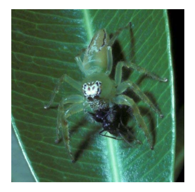
Figure 10. The northern green jumping spider, Mopsus mormon (female)

The northern green jumping spider Mopsus mormon is the largest salticid in Australia (measuring up to 18 mm in length for the female and 12 mm for the male). The male is green with long strong front legs with black or brown coloured femora (first long segment of the leg), the other legs are light brown with green femora. The female is green and does not have black markings on the two front legs. The area around the eye spots is patterned with red and white (Figure 10).