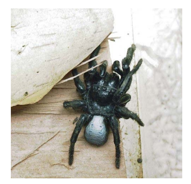
Figure 3. The northern mouse spider, Missulena pruinosa (male)

The northern mouse spider is dark brown to black in colour with shiny black legs and cephalothorax. Females are about 30 mm in body length and are larger than the males, which are about 18 mm in body length. The males have a distinctive white or bluish-white patch on the top of the abdomen. Males are often seen wandering in search of females from August to December. Females rarely leave the burrow and are usually not encountered unless their burrows have been flooded after heavy rainfall or they have been disturbed by gardening or earth works. No fatalities have been recorded from bites of this species although the bite can be painful and cause headache and nausea (Figures 3 and 4).