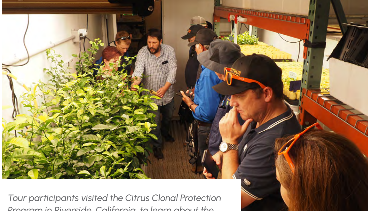
Tour participants visited the Citrus Clonal Protection Program in Riverside, California, to learn about the benefits of having an industry standard for use of disease tested nursery stock