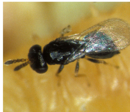
Wasp parasite ready to lay eggs into a palm leaf beetle larva

Parasitic wasps are generally small and have a specific range of “hosts or prey”. They lay their eggs into the body of their prey. The eggs hatch and develop while feeding inside their host.