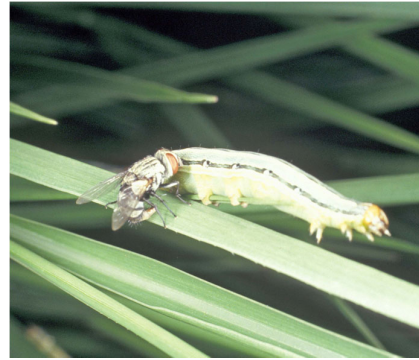
Tachinid fly depositing eggs onto a caterpillar

Tachinid flies are parasitoids of caterpillars. Adult flies glue their eggs to the body of a caterpillar, when the egg hatches the maggots tunnel into the caterpillar's body where they feed and eventually kill the host. The adult flies feed on nectar.