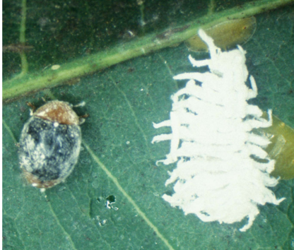
Mealybug ladybird adult and larva

Ladybirds are circular or oval-shaped beetles that feed on a large range of pests including scales, mealybugs and whiteflies.