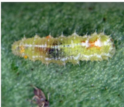
Hover fly larva

Hover fly larvae predate on small insects such as aphids, whiteflies, thrips or scales. They capture the prey and suck out the body contents. Adult hover flies are pollinators of garden plants and ops.