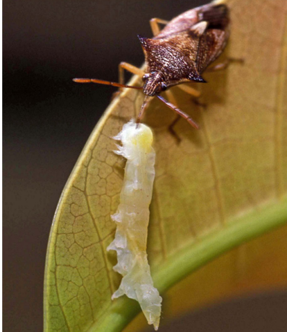
Predatory shield bug

Predatory bugs kill their prey with their piercing mouthpart (called a proboscis) and suck out the body contents. There are many different types of predatory bugs, some are small such as the minute pirate bugs which feed on aphids or thrips. Other predatory such as the big eyed bugs feed on mites, thrips, whiteflies, moth and butterfly eggs. Predatory shield bugs and assassin bugs feed on caterpillars.