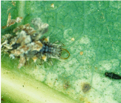
Lacewing larva ready to attack a thrips

Lacewing larvae or “antlions” capture and eat insects such as aphids, caterpillars, thrips, mealybugs, various moth eggs and whiteflies.