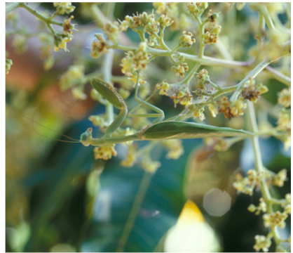
Praying mantis attempting to capture insects

Praying mantises have large eyes and powerful front legs for catching prey. They are general predators of many types of flying insects.