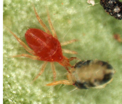
Predatory mite attacking a two-spotted mite

mites are generally bigger and move faster than their prey.