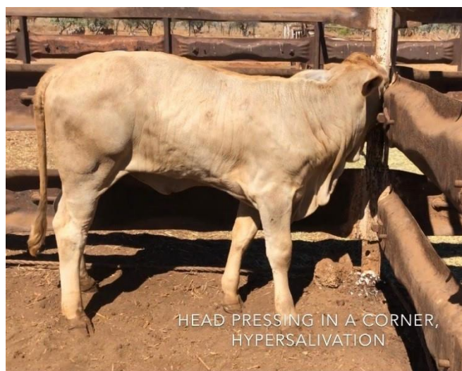
Figure 3: weaner salivating and head pressing in corner of yards