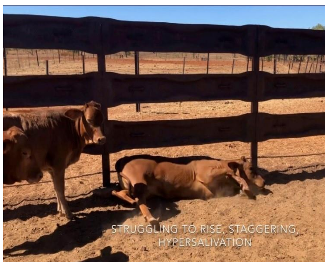
Figure 2: weaners salivating, staggering and struggling to rise

A presumptive diagnosis was made within 24 hours of investigation. The station manager was advised to limit the amount of high quality hay given to the weaners, slowly increasing the volume, to allow the rumen microflora to adapt to the change in feed. By day 5, no further cases had occurred and mildly affected animals were returning to normal without requiring medical intervention. The veterinary officer also explained to the manager that if the same conditions were to occur again, the effects of a sudden feed quality and quantity change can be mitigated with the use of injectable Vitamin B complex for a few days after weaning. However, this may be a cost-prohibitive option when dealing with large mobs. Alternatively, close observation of the mob and injecting affected animals with Vitamin B1 early in the disease course, may lead to a remission of clinical signs within 6-24 hours. A total of 15 animals died or were humanely destroyed; morbidity was approximately three per cent and mortality less than two per cent. Cases have been reported elsewhere of losses up to 10%.