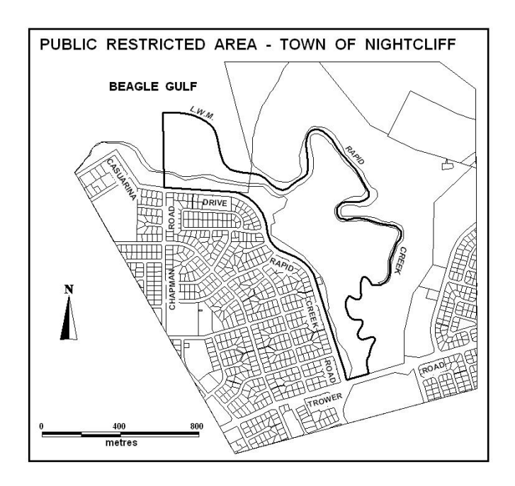
Figure 3 - Rapid Creek Foreshore Public Restricted Area