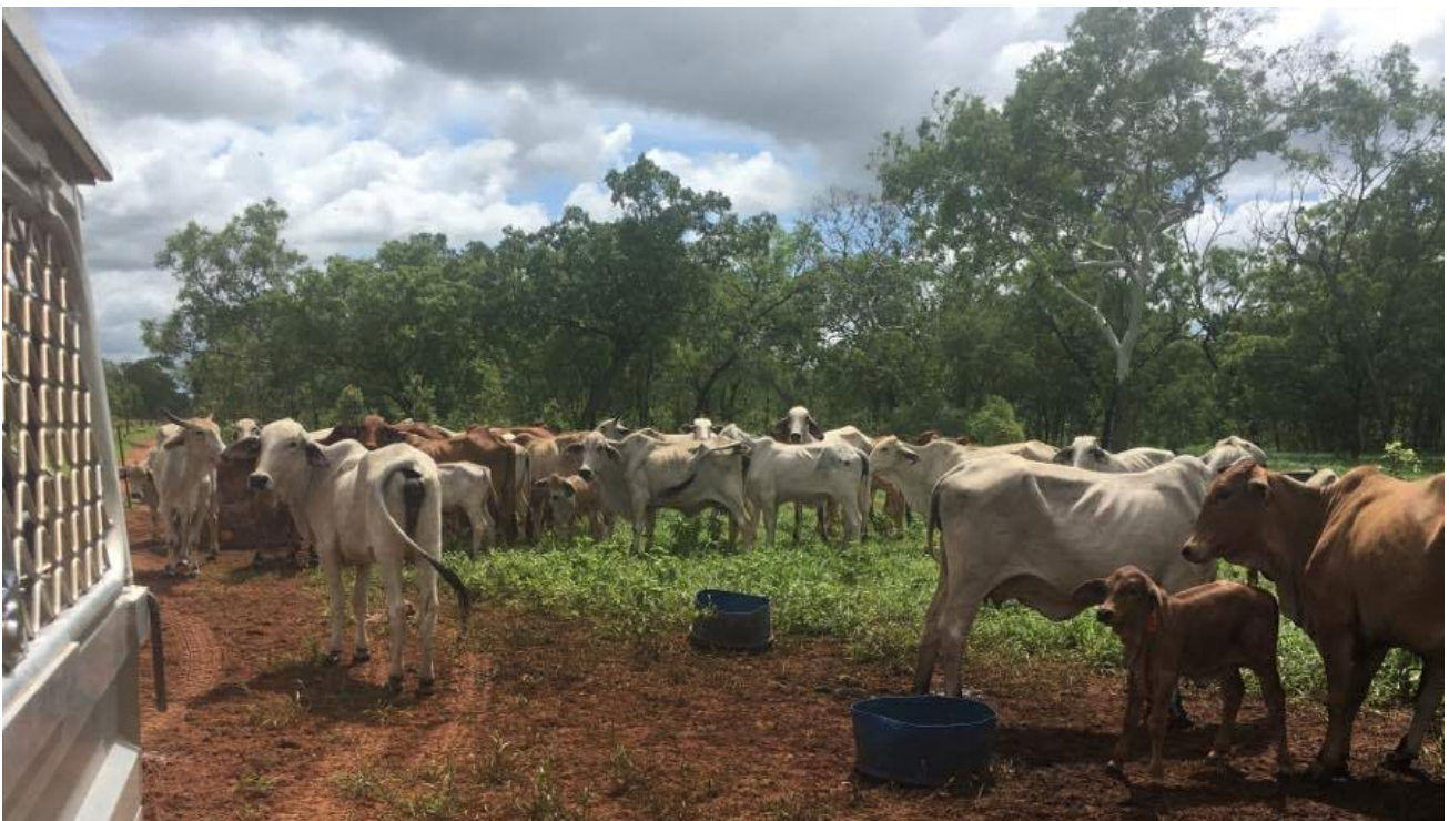
Figure 1: Cattle herd investigated following losses

It is important to remember that salmonella poses a threat to humans. Salmonella is spread relatively easily to humans and/or other animals as it can be ingested through direct or indirect contact with faecal material. If you believe your animals have salmonella, please contact your regional DPIR veterinary officer or local veterinarian for tests which can be run to ensure a correct diagnosis is made and appropriate medication administered. There are a number of alternative diseases that can cause the syndrome seen. Salmonella is not a common diagnosis in Northern Territory herds. There should be few consequences for this herd under improved management.