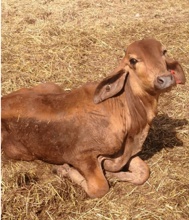
Figure 2: BHV-5 affected recumbent weaner heifer

The manager of a property in the Katherine region reported sudden death in 26 weaner cattle from a herd of 2000 over the space of a few weeks. The cattle had been weaned, processed, and transported to the property in multiple consignments during the preceding month. Weaners had access to weaner pellets, hay, and unimproved pasture once they arrived at the property. Conditions had been particularly wet during the previous months.