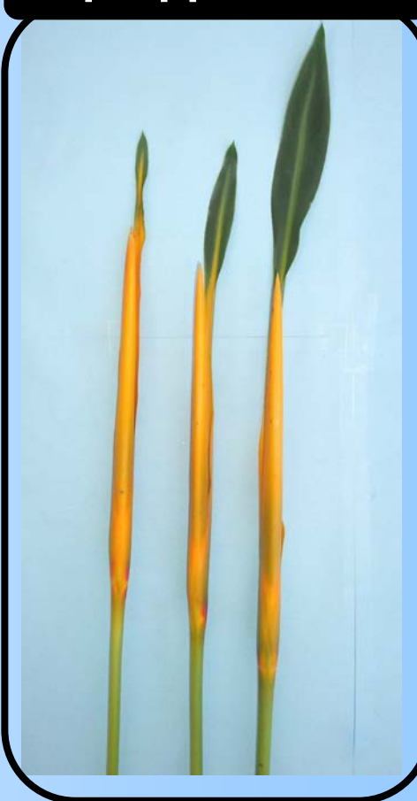
Green tips can remain up to 4 mm