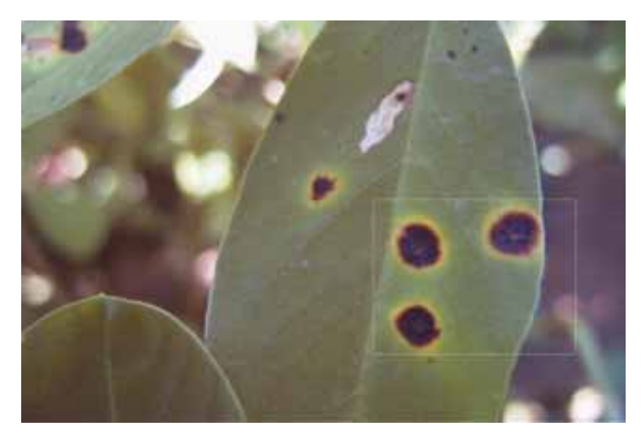
Figure 2. Peanut leaf infected with early leaf spot lesions, Cercospora arachidicola

Leaf scorch (caused by Leptosphaerulina crassiasca ) usually appears at the leaf apex, followed by the development of a wedge-shaped lesion with a vivid yellow zone around the advancing disease margin. Leaf scorch is common early in the season and is often mistaken for a leaf spot. Identification can usually be distinguished from leaf spot by the irregular pattern of the yellow portion of the leaf. Occasionally both leaf spot and leaf scorch can coexist in the same section of the leaf making identification difficult for the novice.