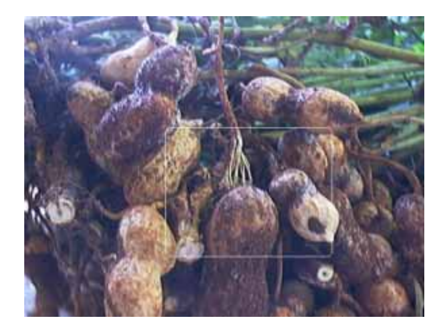
Figure 7. Pod rot and peg shredding caused by pod rot complex

Peg and pod rots become obvious near the end of the growing season. Peanut peg and pod rots were found to be associated with at least three fungi: R. solani (AG 2-2), Pythium spp. and Fusarium spp. (often referred to as pod rot complex). The pre-disposing factors are canopy closure, coupled with situations where pooled irrigation water sits in the furrow and provides very humid, moist conditions, and little opportunity for ventilation. The canopy can still appear green and healthy from the surface even where pod rots were found to be active below ground.