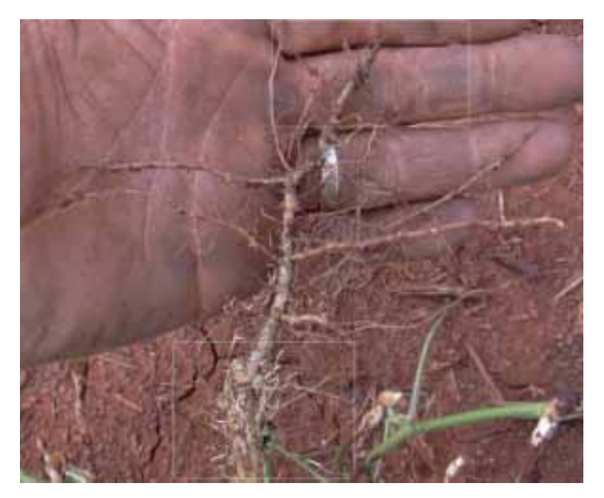
Figure 6. Root rot caused by Pythium spp. Note the new growth of adventitious roots off the main tap root and the blackening of the tip of the main tap root.

Peg and pod rots become obvious near the end of the growing season. Peanut peg and pod rots were found to be associated with at least three fungi: R. solani (AG 2-2), Pythium spp. and Fusarium spp. (often referred to as pod rot complex). The pre-disposing factors are canopy closure, coupled with situations where pooled irrigation water sits in the furrow and provides very humid, moist conditions, and little opportunity for ventilation. The canopy can still appear green and healthy from the surface even where pod rots were found to be active below ground.