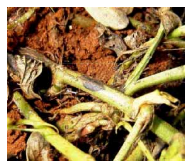
Figure 5. Limb scab on peanut, the early stages of Rhizoctonia solani infection

Stem rot of peanuts, also called white mould, or Sclerotium rot is also a late-season disorder in the Katherine Daly Basin. White mould does not occur until mid-season when the foliage has covered the row middles. White mould appears to be more prevalent in the wet season crops and is often exacerbated by higher temperatures. The first obvious symptom of the disease is yellowing and wilting of the lateral branch, the main stem, or the entire plant. Sheaths of white mycelium (the body of the fungus) can be seen at or near the soil line around infected plant parts. Round sclerotia (dormant fungus) 0.5-2.0 mm in diameter, are produced on affected plant parts and the soil surface. Sclerotia are initially white but later turn dark brown.