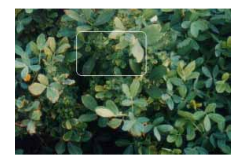
Figure 4. Peanut plant affected by little leaf

Little leaf, "witches broom" or phyllody is caused by a phytoplasmid. Phytoplasmids are poorly understood organisms; the symptoms they cause were often misdiagnosed as caused by viruses. The leaves of symptomatic plants can display severe yellowing, reduced leaf size and deformation. Plants are very bushy in appearance, with a proliferation of stems and leaves. Leaflets are pale yellow and small. Pegs tend to grow upwards and pod yields are severely reduced. The disease is spread by insect vectors, mainly, leafhoppers and sapsuckers. Little leaf is usually sporadic and patchy, with no practical control recommended.